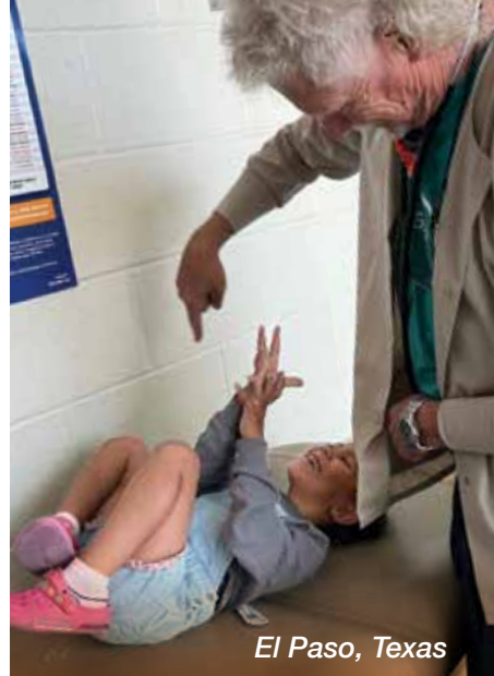
El Paso, Texas