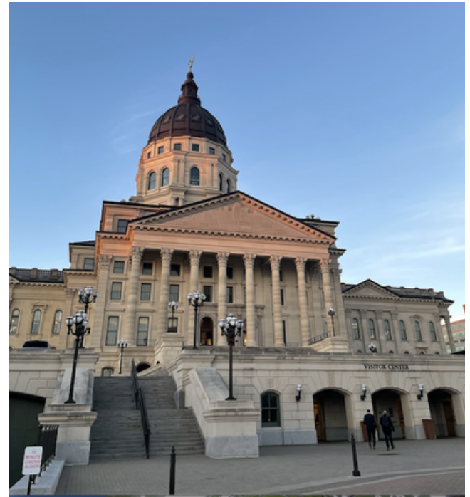
Kansas Capitol Building, Topeka, KS