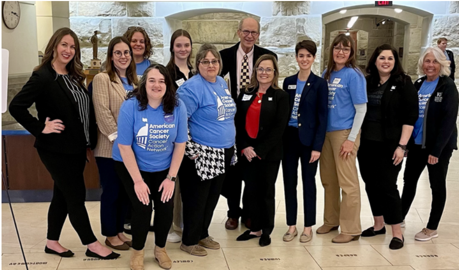
ONS members & the American Cancer Society Action Coalition at the Kansas Capitol advocating for Medicare expansion