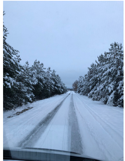
On the road in Ukraine to a remote clinic