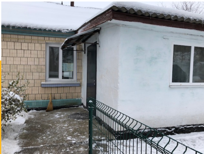
The medical clinic: no heat, indoor plumbing, or running water

More of Cathy's story in the next issue of the newsletter!